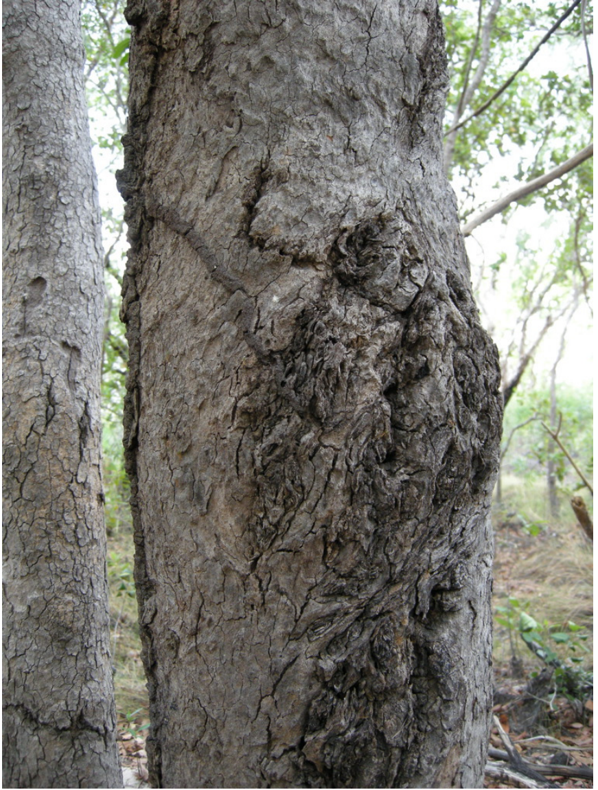
There it was an ancient 'LL' blaze – so old that had we not been looking for it we would have missed it entirely. (site survey 2008)

On looking around we found what we also thought were old rope burns, and ancient cuts and slashes on the trees nearby but on a follow up survey with archaeologist Douglas Hobbs these proved to be a type of termite furrowing. However – had we found Leichhardt's camp exactly where he said it would be...?